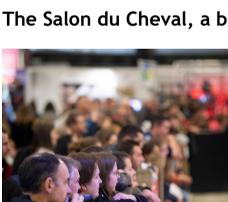
Lots of passionate fans on the edge of the entertainment arena

If the jumping arena is the heart of the Jumping International de Bordeaux, the Salon du Cheval is undoubtedly its lungs. The event has grown considerably over the years, from a simple offering of stands to one of the biggest horse fairs in France (+20% attendance by 2023). The Salon is, of course, first and foremost a (large) village of exhibitors, not just for equestrians, who can find everything they need in terms of equipment for themselves and their horses, materials for the stables or for transport, and innovations, especially those designed to improve the well-being of equines, which have been flourishing in recent years... but also for those less familiar with this universe. And let's not forget the catering facilities, offering a wide range of French South-West cuisine.