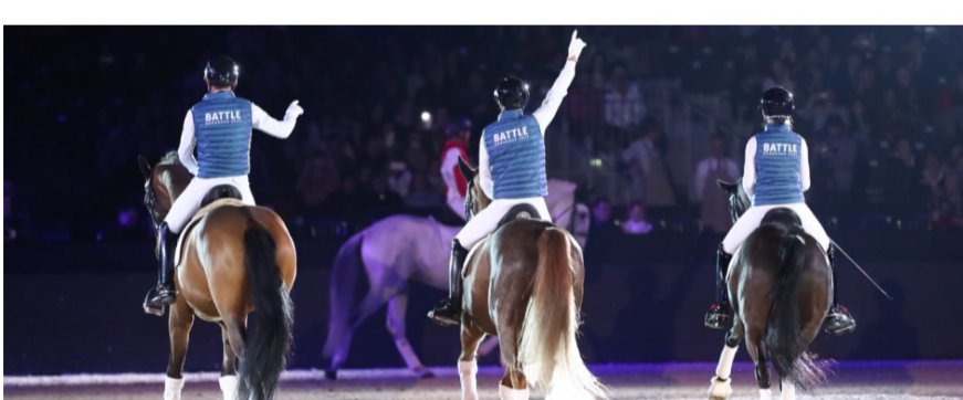
Great atmosphere at the "Dressage Battle"